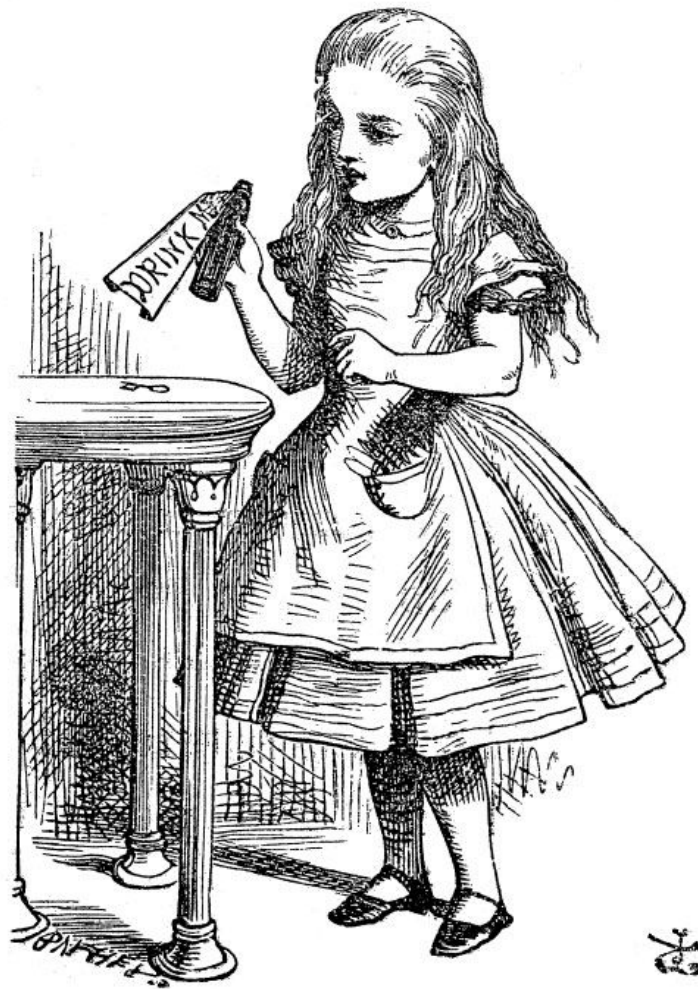
(“Drink-me’ bottle” from Alice's Adventures in Wonderland , illustrated by John Tenniel)

discipline. Furthermore, the profusion of gastronomical references and their direct consequences on the protagonist depict a world where the act of eating itself was fraught with dangers.